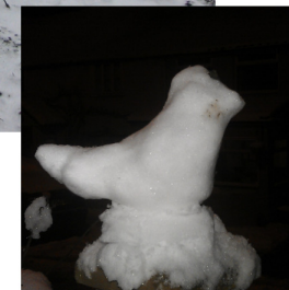
Snow sculptures by Tris Fry and Traci Pepler of Sparrick Lane